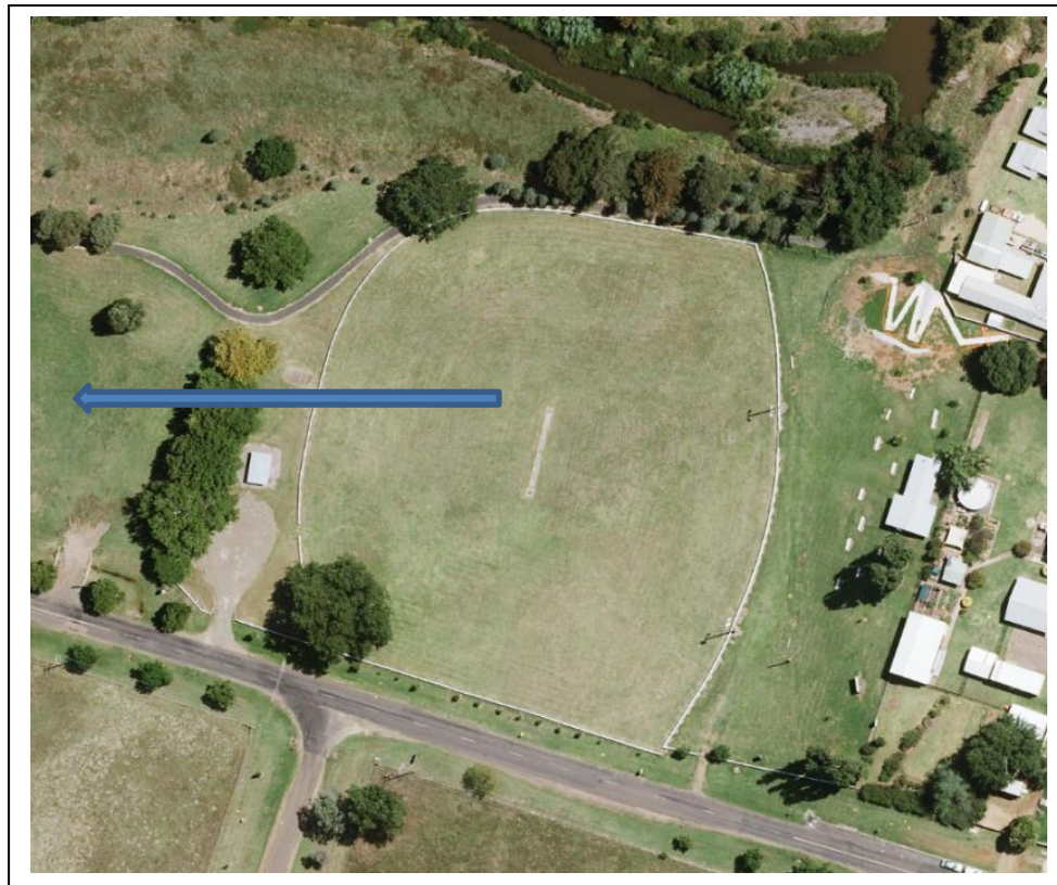
Figure 2- Distribution site location

Distribution will occur from the Nundle Recreation Reserve, Oakenville Street, Nundle (refer to figure 2) at a suitable day and time to be arranged between Council and the interested recipient... It will be the recipient's responsibility to collect their allocated timber product within the agreed day/time or forfeit the allocation of the timber product. Recipients will be required to sign a site specific induction for prior to collection.