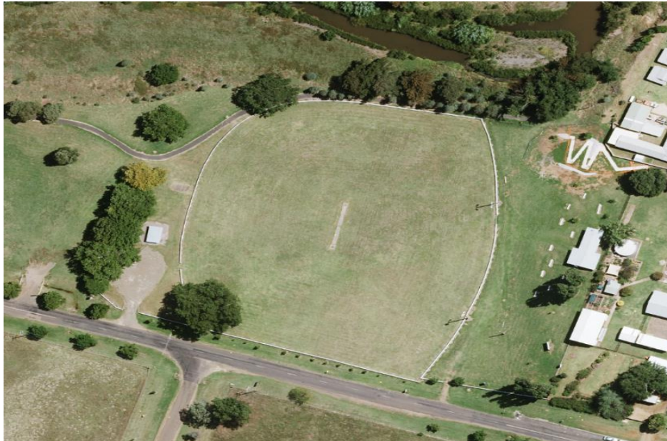
Figure 1 –Nundle Recreation Reserve

To address safety concerns with the existing deteriorating post and rail fence at the reserve council will remove the fence in entirety and replace with a chosen more sustainable product. Whilst some of the rails within the existing fence are deteriorated there are a number of rail sections which are of reasonable quality and may suit use in recycled timber projects.